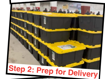
Step 2: Prep for Delivery