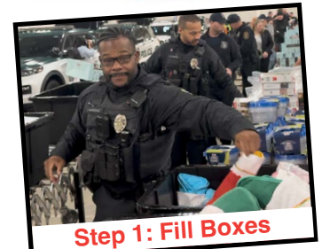
Step 1: Fill Boxes