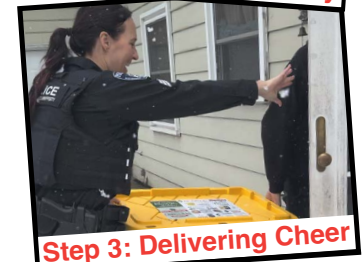
Step 3: Delivering Cheer