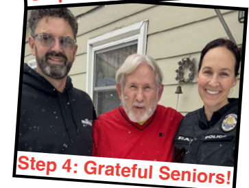
Step 4: Grateful Seniors!