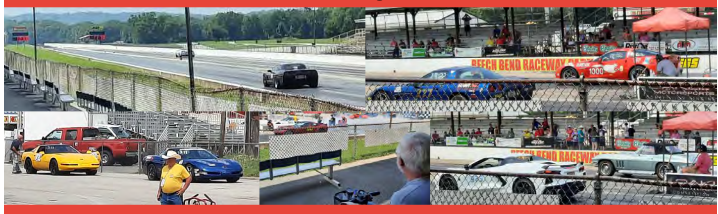
Ballpark Dinner/Team Spirit Party