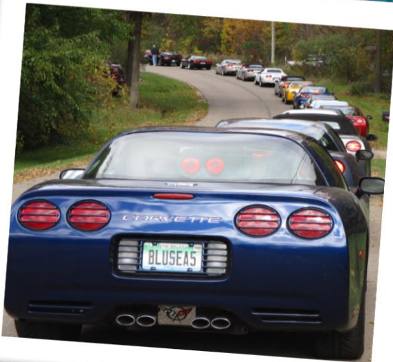
Bingo at Delta River Senior Village 11-5-16 (top) Fall Color Tour 10-22-16 (bottom left)

See Ben Behnke when making your next new or used automotive purchase!