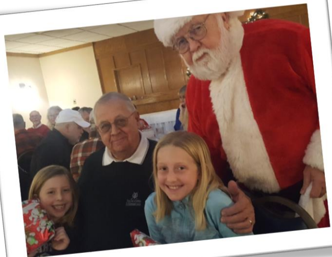
Coral Gables Restaurant, East Lansing Saturday, December 3, 2016