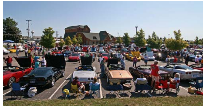
Crossroads car show

The summer getaway to Mackinaw City, MI and 27 th annual Corvette Crossroads car show is scheduled for August 26 th 10:00AM to 2:00 PM.