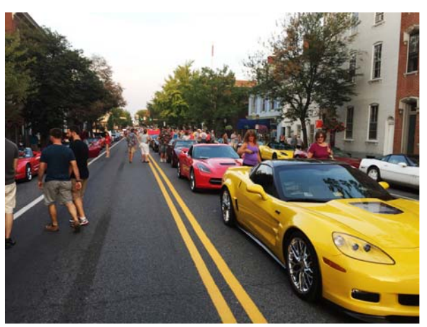
Back to the Bricks Corvette Reunion