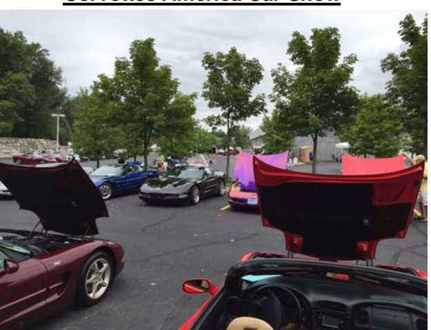
Bloomington Gold Cruise