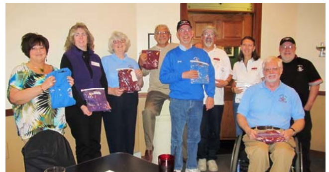
Top Ten Banquet