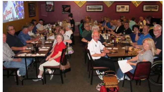
Bowling Challenge Lunch

The 1 day activity is sponsored by Paragon Corvette Reproductions located at there facility 8040 South Jennings Rd. in Swartz Creek. It is scheduled for September 19 th . Food and music provided.