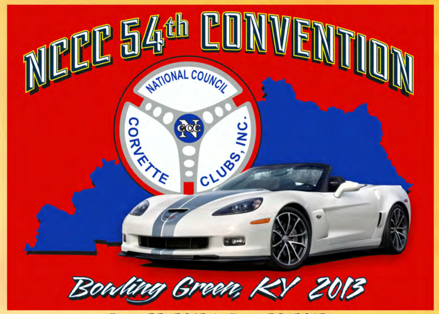
June 23, 2013 to June 28, 2013

Bowling Green has a rich heritage and showcases many opportunities for adventure. In addition to the usual events that are expected at a National Corvette Convention you will have the opportunity to share in some of this heritage. Aside from beautiful horses, bourbon and fast Corvettes, one of the biggest underground cave systems known is less than an hour's drive away. Kentucky is home of the premier horse race, the Kentucky Derby, and the track, Churchill Downs, along with the Louisville Slugger Bat Company/Museum, the Ali Museum and the Belle of Louisville are all located in Louisville, just two hours north of Bowling Green. Bowling Green has a AA Baseball Team, a Rail Museum, The National Corvette Museum, one of the original Shaker Villages and Beechbend Amusement Park and Splash Lagoon just to name a few. There are antique shops and interesting sights in just about every little town you drive through. About an hour South, Nashville has all the honky-tonk and glitz of the country music capital of the world. The Grand Ole Opry, Opry Mills, the General Jackson Showboat, the Gaylord Entertainment Center and Hotel, the Hermitage, home of Andrew Jackson, are but a few of the interesting sights to visit. We hope you make your plans to join us for the fun and festivities in "Bowling Green in 2013".