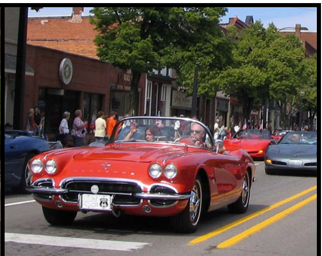
Marshall Memorial Day Parade