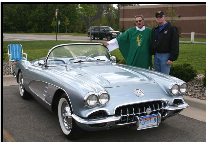
Blessing of the Vettes